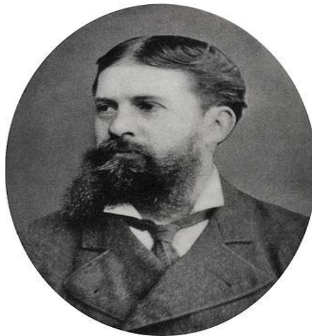
Charles Sanders Peirce

The word pragmatism is derived from the Greek word “ Pragma ” which means action and “ Pagmatikos ” means utility. It was first Charles Sanders Peirce who introduced this word to the philosophy in 1878. The philosophy of pragmatic school is based on activity.