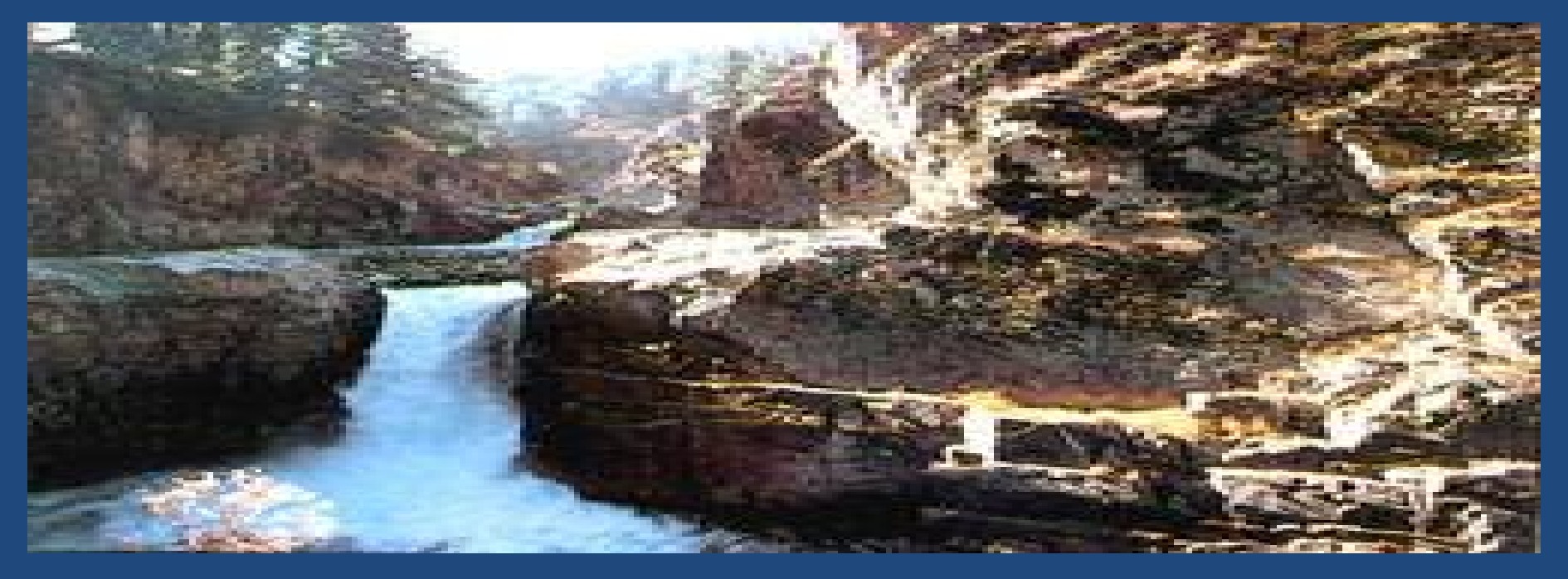
The Aharbal falls

• Gradually, the distant rumble becomes a roar as one approach the waterfall of Aharbal, which crashes down a narrow gorge. Aharbal is more than just a waterfall. There are several places to picnic in the surrounding areas, as well as delightful walks of varying lengths all over the hillsides. An interesting treks to the high altitude lake of Kounsernag at 13,500 ft above sea level-takes off from Aharbal.