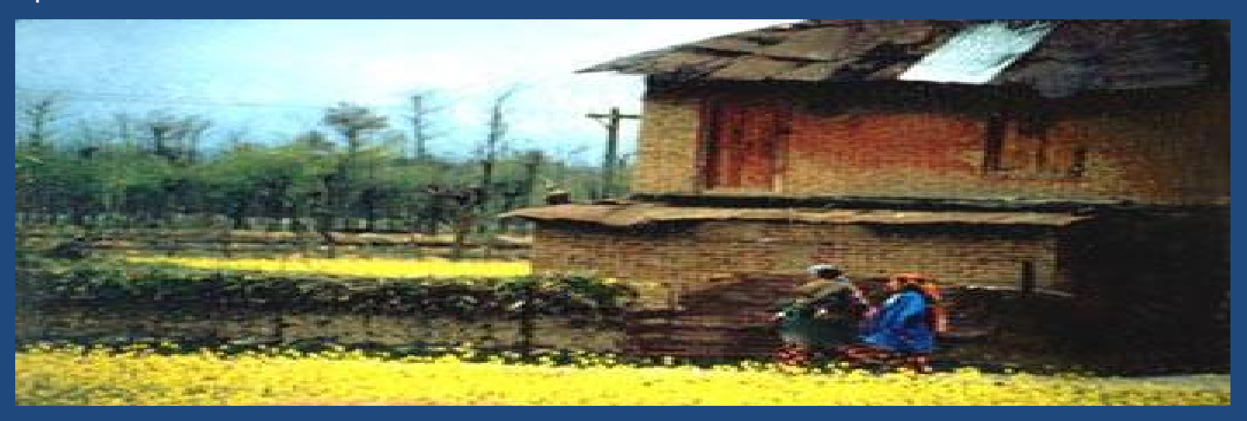
View of rural Kashmir on way to Yusmarg

• A two hour drive from Srinagar (47 kms) will take you to acres upon acres of grassy meadow ringed by forests of pine, and towering beyond them, awesome and majestic snow clad mountains. This is Yusmarg - close enough to Srinagar for a picnic, idyllic enough to make you want to stay for a few days. Here are walks of every sort - a leisurely amble along flower-strewn meadows or away to where a mighty river froths and crashes its way over rocks, its mild white foam earning it the name of Dudh Ganga. Further down, a captivating lake, Nilnag, is cradled by hills. Nearby are several peaks - Trata Kutti and Sang Safed to name a couple of them. About 13 kms from Yusmarg, a short detour away from the Srinagar road, is Charari- Sharief, the Shrine of Kashmir's patron saint Sheikh Noor-ud-din or Nund Reshi.